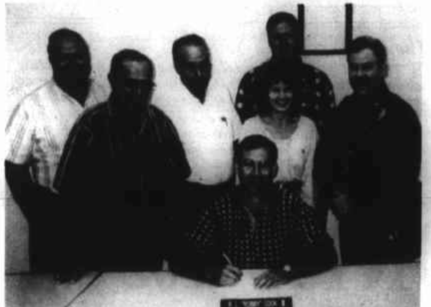
Red Ribbon Week Oct. 21-29

Residents of nursing homes and chronic-care facilities. Adults and children with chronic heart, lung, kidney or blood disorders, diabetes, or immune problems.