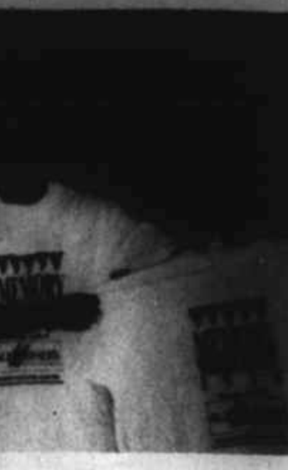
Ready to walk?